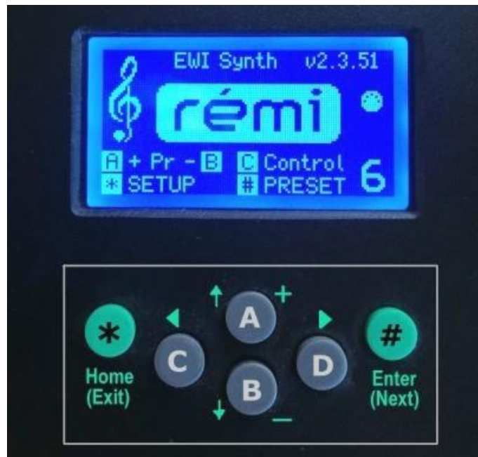
REMI Synth Prototype Front Panel -- Home Screen

The front-panel GUI can perform only a subset of operations provided in the CLI. The GUI is convenient to be able to perform often-used tasks without the need to connect a PC terminal. In this capacity, the front-panel GUI serves two main purposes: