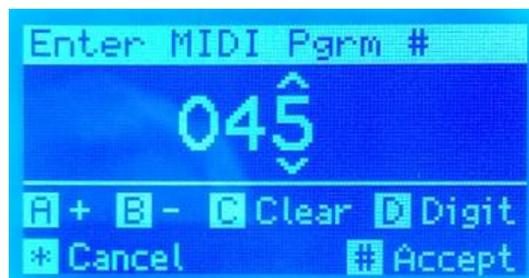
Example Data Entry Screen