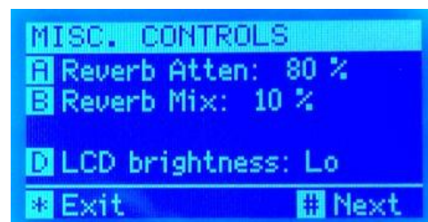
Controls Screen – page 1