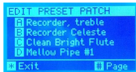
Preset Patch (select) Screen